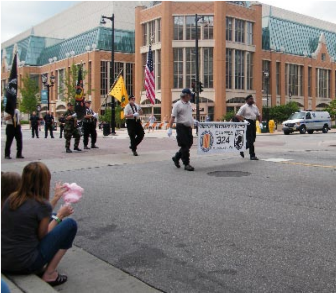
Chapter 324 color guard in the 2010 Memorial Day Parade.