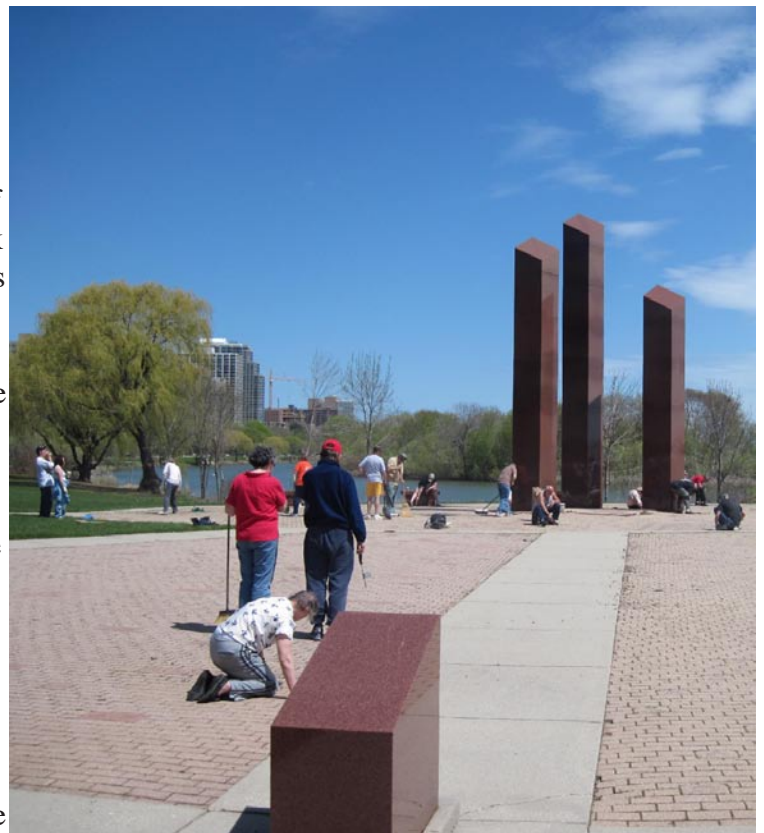
Cleaning the Vietnam Veterans Memorial on the Milwaukee Lakefront