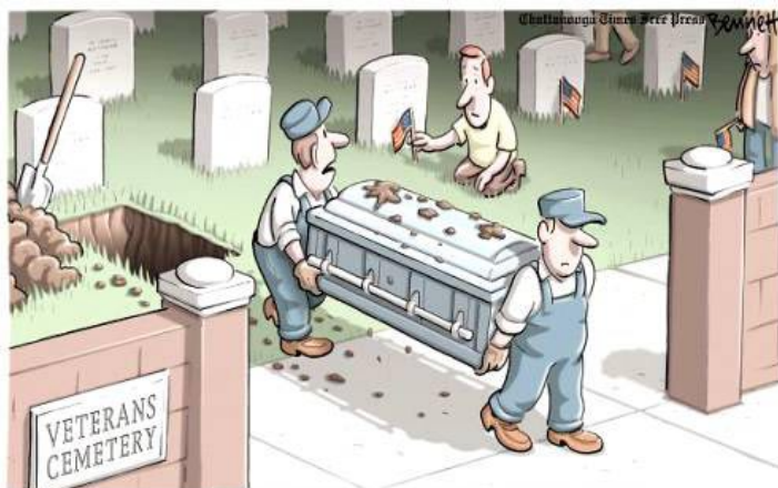
'They found out he was gay.'

"People outside the military don't know about PTSD or TBI. It's all new to them. So they worry, 'Am I going to see some sort of outburst? What might he do?'"